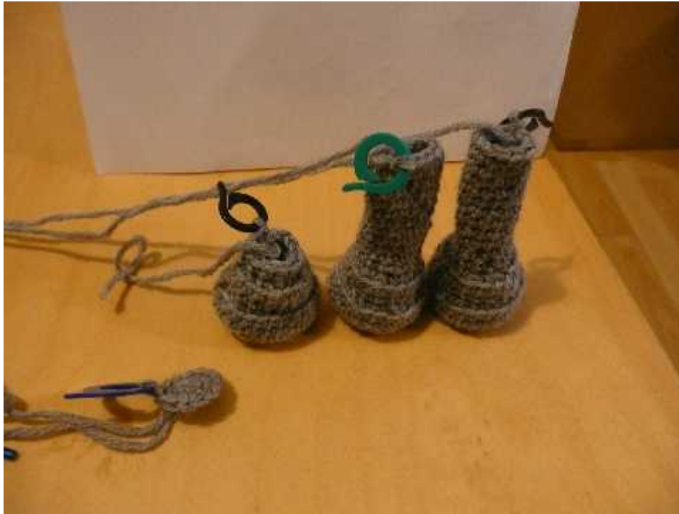
In progress feet and legs